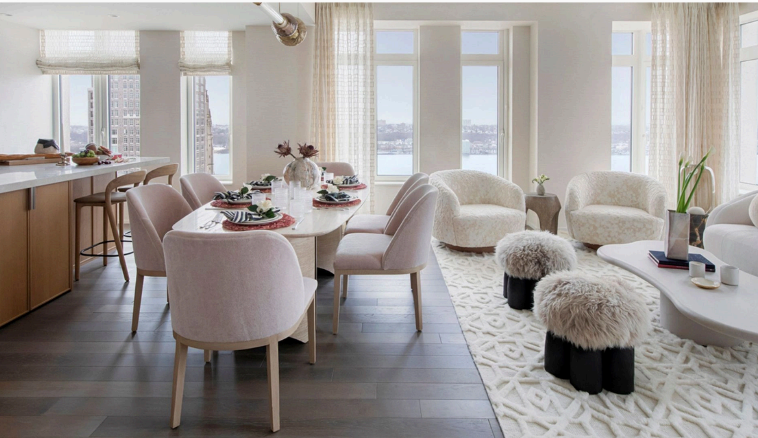
An Olivya Stone Dining Table anchors the room, giving way to expansive river views.