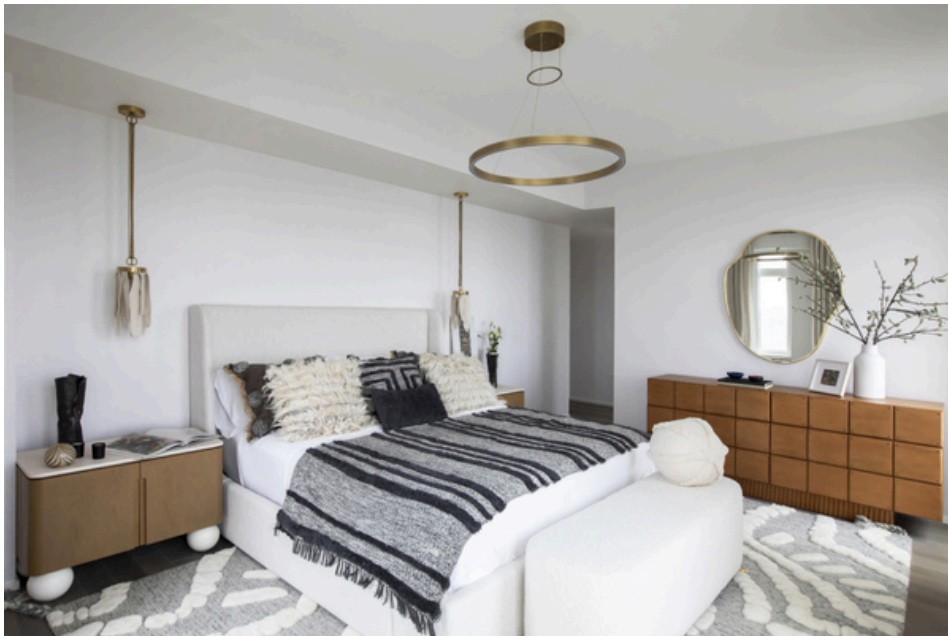
A Woven rug and feather pendants from Lowland Studio.

In the living room, each piece of furniture promises comfort and soothing rest - cream swivel armchairs from Holly Hunt, shaggy poufs with a base of Iroko wood from GARDE Shoppe, and a curve backed sofa that rounds out the inviting space. A cement coffee table from Bieke Casteleyn is noteworthy and elevates the room while the Kravet rug also serves as a conversation starter.